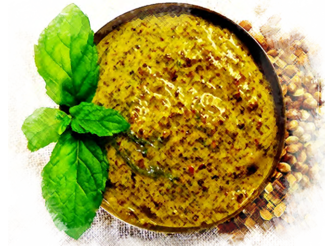
Bhang ki Chutney