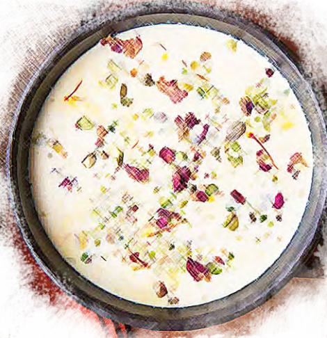
Jhangora Ki Kheer