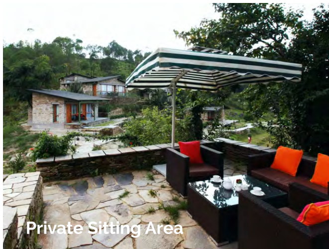
Private Sitting Area