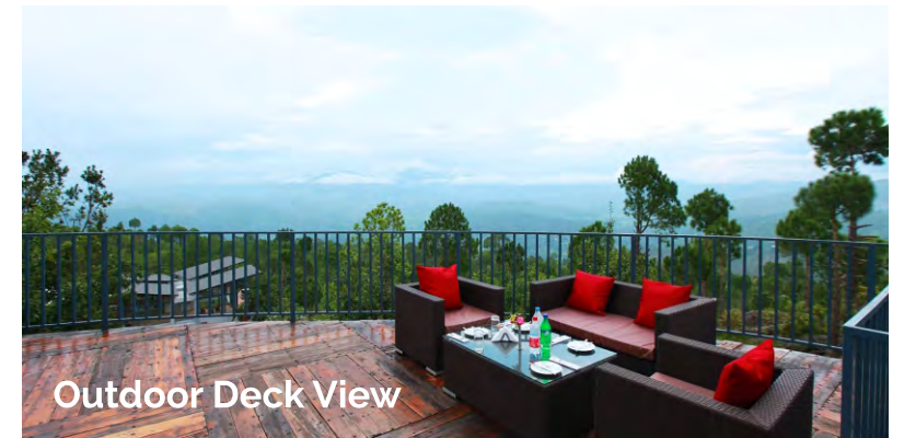
Outdoor Deck View