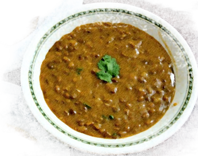
Gahat Ki Dal